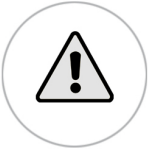
SERVICE PIT SECURITY